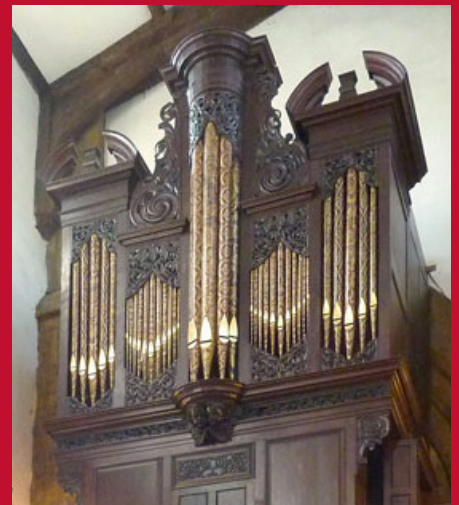
The Windsor Castle organ made in 1704 by Father Smith and transferred to Finedon in 1717. Recently restored.