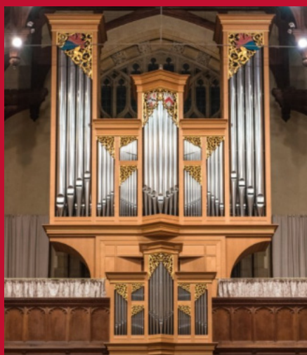
A late 20th century organ made by Frobenius of Senner Copenhagen in 1984.