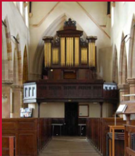
The Chapel Royal, St James' Palace organ by Thomas Elliot of Tottenham Court Road London made in 1819 and transferred to Crick in 1841.